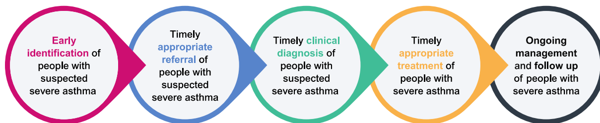
Fig. 1 The scope of the Global Quality Standard encompasses principles to address the unmet need and burden in severe asthma, with the intent to deliver improved care for patients with severe asthma

and advocacy groups, and asthma patients. Second, while aspirational, these standards should also be achievable by most well-equipped health care systems in developed countries. For optimal success, standards must be tailored to local requirements; therefore, national and local clinical groups worldwide must agree to and interpret standards for successful implementation. Accordingly, an implementation plan should be agreed upon by local leaders, and progress regarding process, outcomes, and uptake must be measured locally. Finally, this initiative is intended to allow for the comparison of standards achieved across health care systems, and to support the continual development and improvement of these systems to support improved patient care and outcomes. To that end, this document proposes both a list of potential metrics and areas in which localization is required to ensure optimal engagement and uptake. This article is based on Task Force consensus and does not contain any studies with human participants or animals performed by any of the authors.